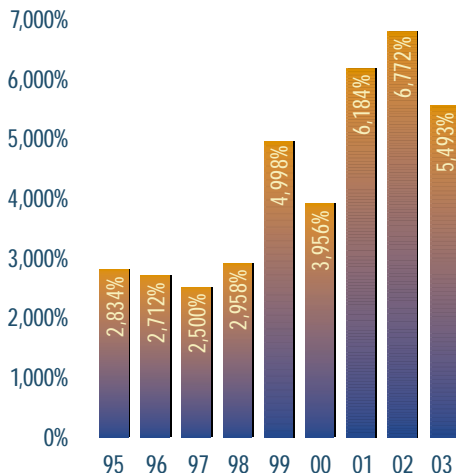
Fast 500 Companies Average Percentage Growth Rate